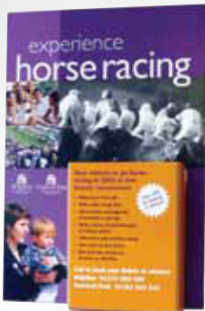
DL Leaflet Dispenser