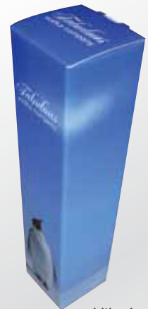
Litho Lam Product Box