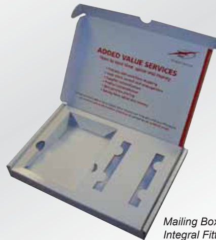
Mailing Box with Integral Fitting