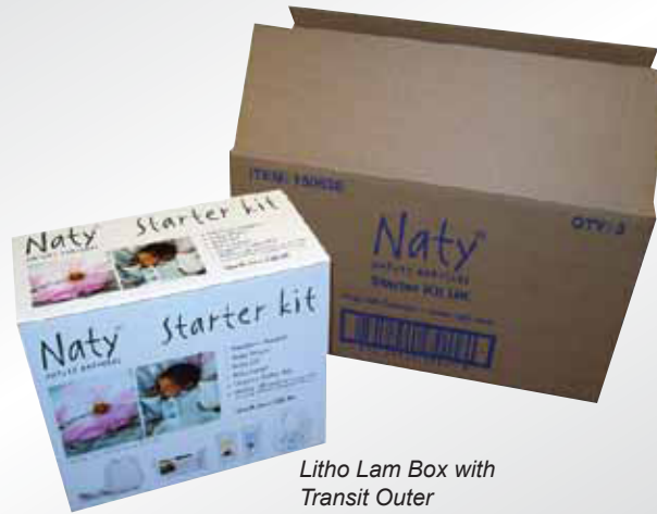
Litho Lam Box with Transit Outer