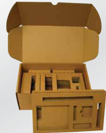
Corrugated Boxes & Inserts